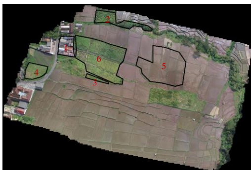
Figure 2 UAV image of study area

The data used as the input is the UAV image taken around the pilot plant of the Essential Institute in Kesamben, Blitar. The captured image has a resolution of 11 cm and is stored in a TIF extension file. This extension is used to keep the geographic coordinates data of the image. An example of a captured UAV image is shown in Figure 2.