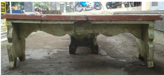
Figure 1. Terrazo seat damaged

Based on the results from interview with five sentra sanitair business units, terrazzo materials seat made of several materials that are cement, grit, crushed rocks, mill, terrazzo materials, wire, and dyes. But the main raw material is cement, grit, crushed rockss, and mill. Table 2 is the composition ratio of main raw material in the five business units that produces terrazzo materials seat.